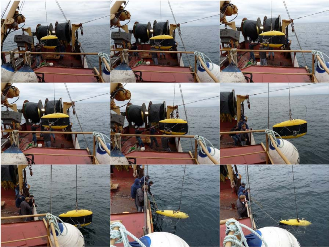
Figure 1: Photographic sequence of a routine deployment of the Odyssey IV from the F/V Isabella & Ava using the overhead boom crane. Field operations were conducted at Stellwagen Bank in October 2009.

Odyssey IV. Integration of supervisory control using acoustic modem with Odyssey IV is in progress. The acoustic modem is not available for testing.