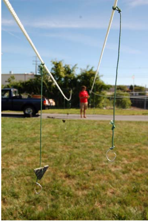
Graham McKay preparing longlines rigged with and without alloys