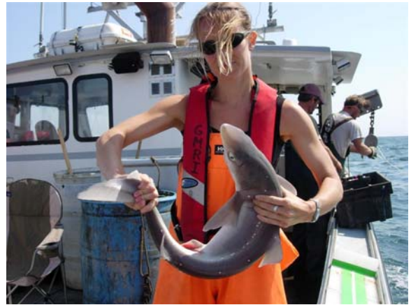
Large female dogfish caught