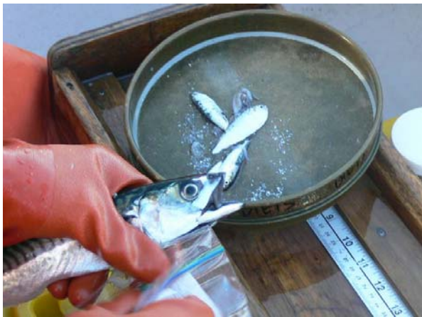
Figure 2. Fresh YOY alewives in the diet of a mackerel caught off the mouth of the Damariscotta River. October 2007.