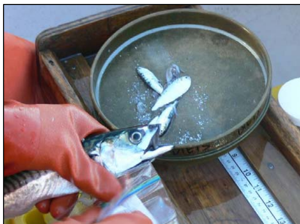
Figure 2. Fresh YOY river herring in the diet of a mackerel caught off the mouth of the Damariscotta River. October 2007.